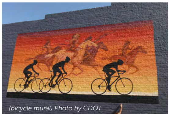
(bicycle mural)