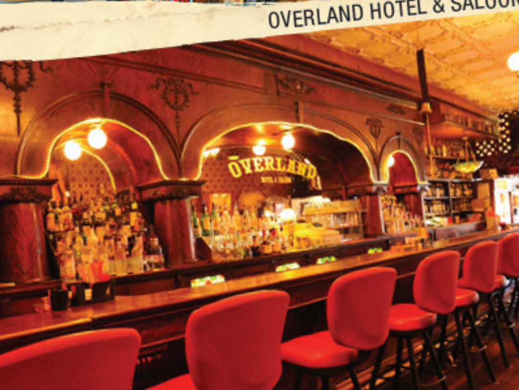
OVERLAND HOTEL & SALOON