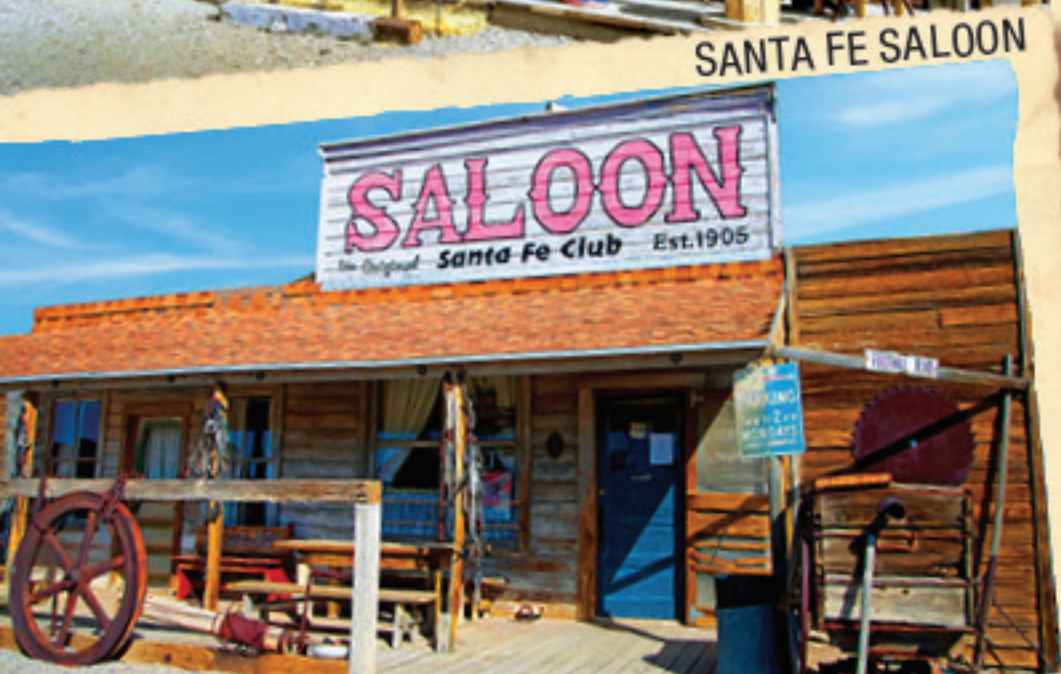
SANTA FE SALOON