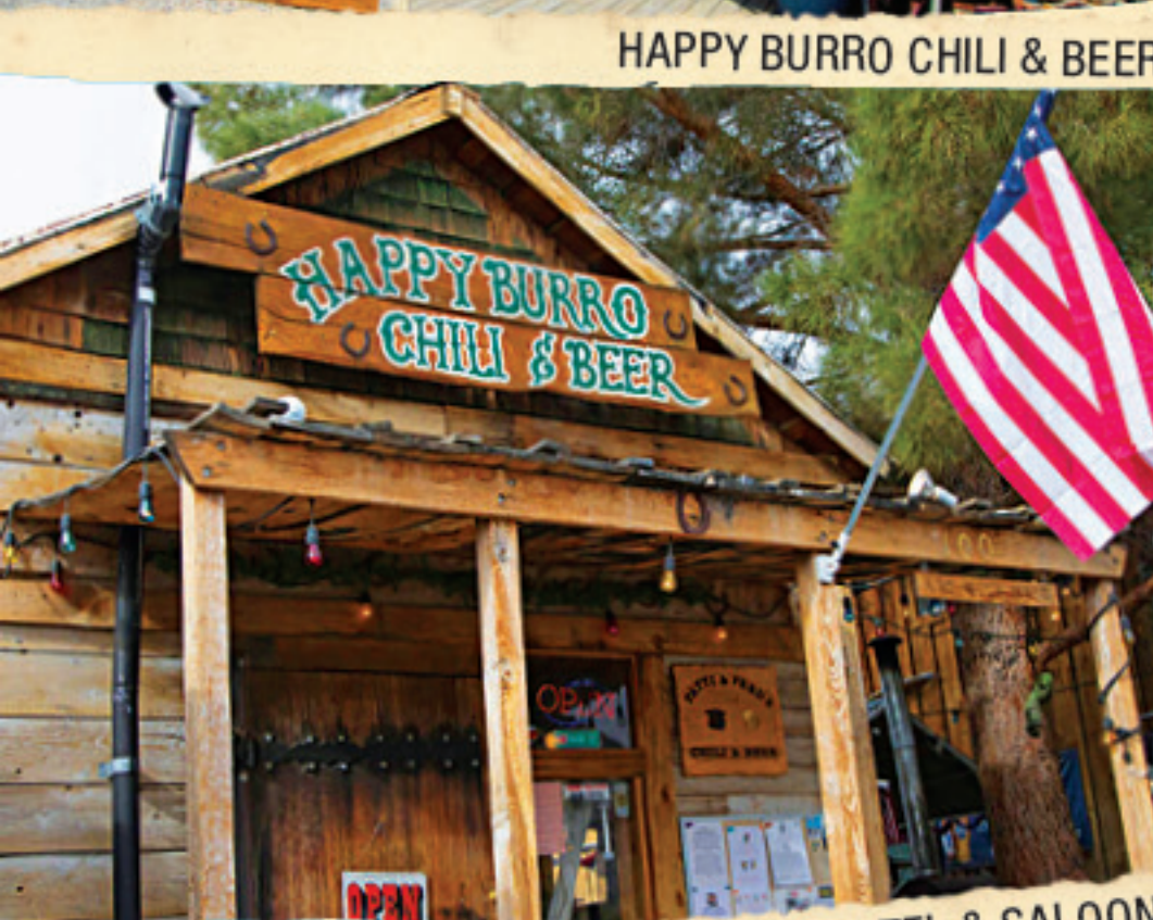
HAPPY BURRO CHILI & BEER