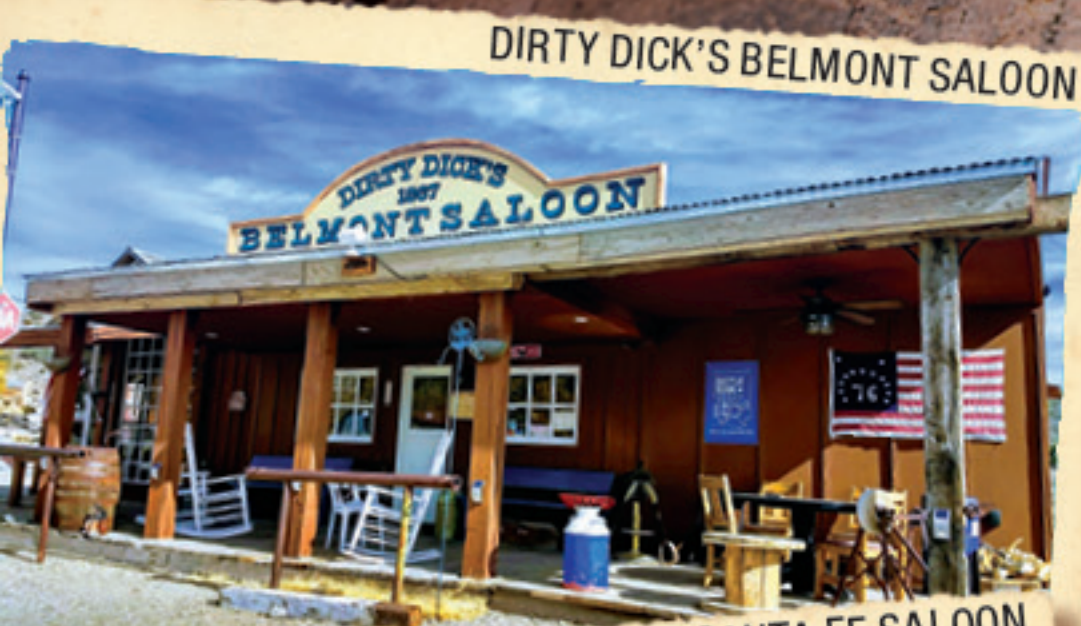
DIRTY DICK'S BELMONT SALOON