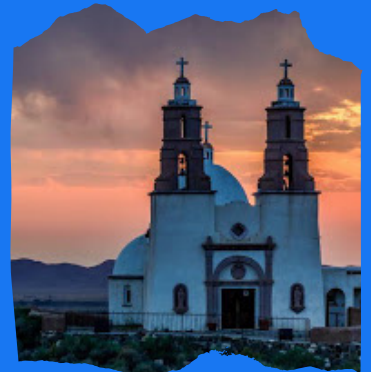
Stations of the Cross Shrine

Stop at our interpretive signs along the way or use the TravelStories app to dive deep into the history of each location. Los Caminos Antiguos Scenic & Historic Byway will take you through the heart of the Sangre de Cristo National Heritage Area, where the old west spirit of honesty, adventure, and small town hospitality is still very much alive.