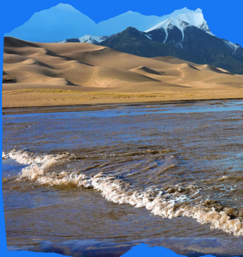
Great Sand Dunes National Park & Preserve