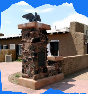
Fort Garland Museum & Cultural Center