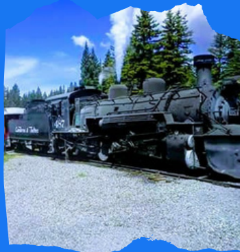
Cumbres & Toltec Scenic Railroad