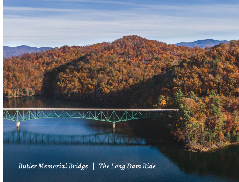
Butler Memorial Bridge | The Long Dam Ride

It's no secret—the geography and scenery of Northeast Tennessee wouldn't be the same without several man-made lakes. The Long Dam Ride leads you through gorges, past rocky cliffs, mountain streams, tranquil lakes, unique sites, and miles of roller-coaster dips and rural charm.