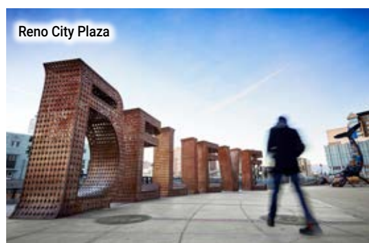
Reno City Plaza

No Tonopah experience is complete without a visit to the fully-immersive Tonopah Historic Mining Park , where you'll discover what made this town the "Queen of the Silver Camps." After a greasy spoon breakfast at Tonopah Station , it's time to blast north, but save room for one of Nevada's most mouth-watering roadside burgers at S'Socorro's Burger Hut in Mina. Keep your art fix in check with visits to the Yerington Theater for the ARTS & Jeanne Dini Culture Center , a rural gallery and art collective, and the incredible schoolhouse-dwelling Oats Park Arts Center in Fallon. Ogle some Burning Man sculptures in Fernley and be ready for far more along Reno's Riverwalk and at the Reno City Plaza , in a town where murals brighten hundreds of walls and exhibitions entice culture vultures at the Nevada Art Museum and National Automobile Museum .