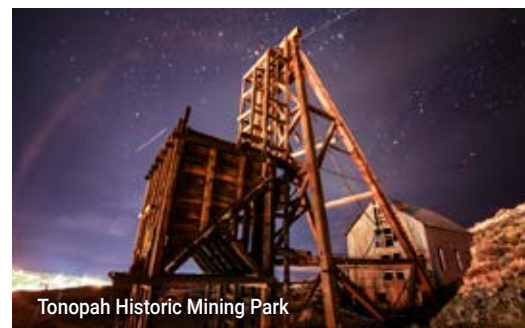
Tonopah Historic Mining Park