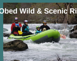
Obed Wild & Scenic River