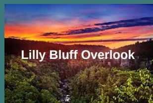
Lilly Bluff Overlook