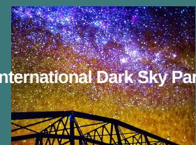
International Dark Sky Park

BIG SOUTH FORK NATIONAL PARK-THE AREA BOASTS MILES OF SCENIC GORGES AND SANDSTONE BLUFFS, IS RICH WITH NATURAL AND HISTORIC FEATURES. OBED WILD & SCENIC RIVER- WAS ESTABLISHED TO PRESERVE ONE OF THE LAST FREE-FLOWING, WILD RIVER SYSTEMS IN THE EASTERN UNITED STATES.