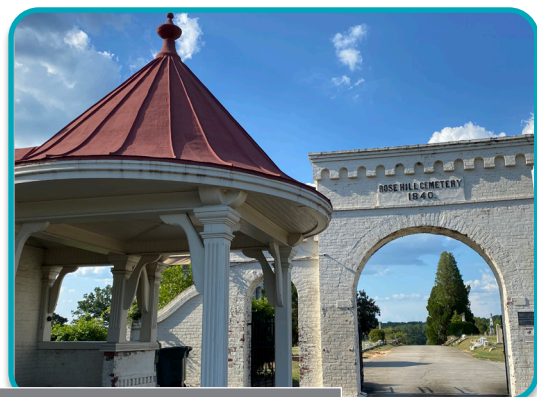
Rose Hill Cemetery