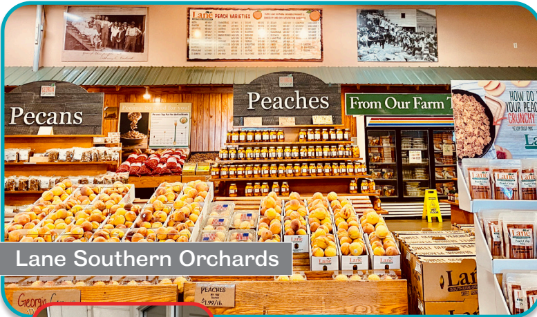
Lane Southern Orchards