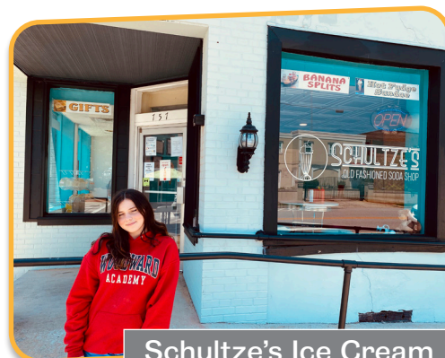
Schultze's Ice Cream

Step back in time and cool your heels (and your taste buds) at the nostalgic Schultze's Old Fashioned Soda Shop for a heaping helping of all of your old soda shop favorites like egg creams, strawberry blondes and brown cows, or try some of their original frozen treats like the Tennessee Jack Sundae – a toffee ice cream laced with a smooth whiskey sweet sauce and garnished with broken Heath bars layered with caramel, butterscotch, and even more Heath bars!