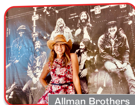
Allman Brothers Band Museum

Also known as The Big House, the Allman Brothers Band Museum was once home to the original members of the Allman Brothers Band and their families and friends from 1970 to 1973. The band spent those three years in The Big House writing and composing many of their most popular songs including Ramblin' Man and Midnight Rider.