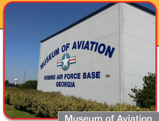
Museum of Aviation

The museum houses over 85 historic U.S. Air Force aircraft, missiles, cockpits and award-winning exhibits including the recently added statue of Eugene Ballard, the first African-American pilot to fly in combat.