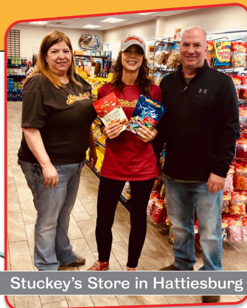
Stuckey's Store in Hattiesburg