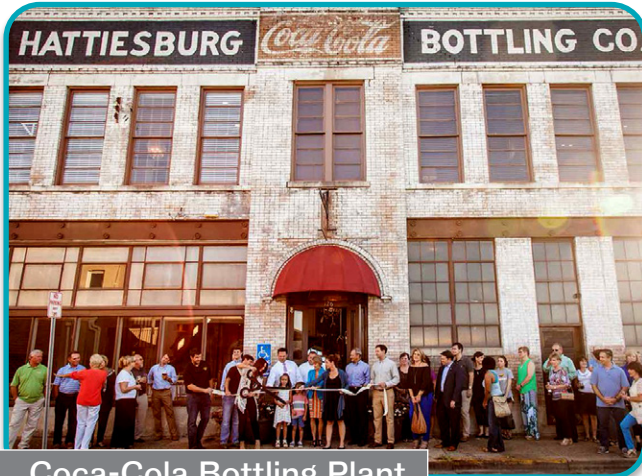
Coca-Cola Bottling Plant