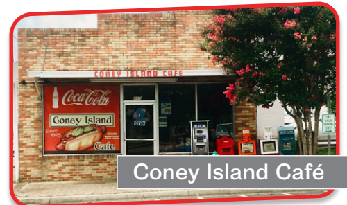
Coney Island Café

Vintage Roadside is a mom & pop business dedicated to celebrating the special places that make road trips fun and serves as Stuckey's Official Roadtrip Ambassador. Visit them at www.vintageroadside.com .