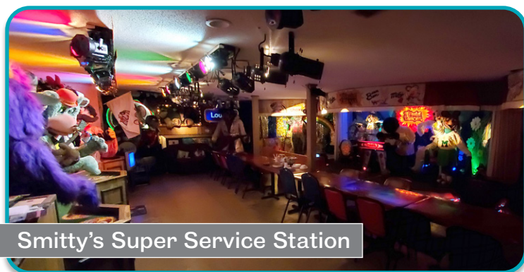
Smitty's Super Service Station

♦ Palestine Gardens, Lucedale This roadside attraction in the woods of Mississippi is a scalable replica of the Holy Lands during biblical times.