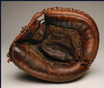
Yogi Berra's Glove

With a mix of iconic moments and items that will surprise you, the Baseball Hall of Fame Starting Nine is a limited-time experience that covers all the bases and creates an immersive Museum experience. Artifacts include the mitt Yankees legend Yogi Berra used to catch the only perfect game in postseason history. The Starting Nine experience also has, the bat Carlton Fisk used to club his famous World Series home run that he “waved fair” for the Red Sox in 1975, a baseball used by Philadelphia pitcher Roy Halladay in his 2010 perfect game and Mets legend Tom Seaver’s cap worn in 1970 as he set a then-record for strikeouts in a game.