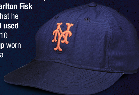
Tom Seaver's Cap

With a mix of iconic moments and items that will surprise you, the Baseball Hall of Fame Starting Nine is a limited-time experience that covers all the bases and creates an immersive Museum experience. Artifacts include the mitt Yankees legend Yogi Berra used to catch the only perfect game in postseason history. The Starting Nine experience also has, the bat Carlton Fisk used to club his famous World Series home run that he “waved fair” for the Red Sox in 1975, a baseball used by Philadelphia pitcher Roy Halladay in his 2010 perfect game and Mets legend Tom Seaver’s cap worn in 1970 as he set a then-record for strikeouts in a game.