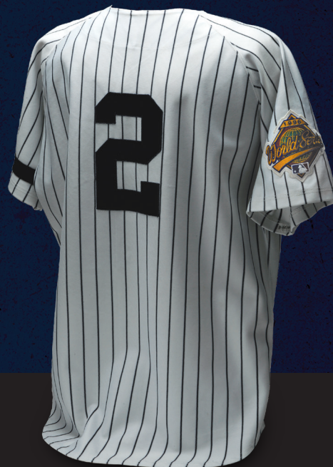
Derek Jeter's World Series Jersey