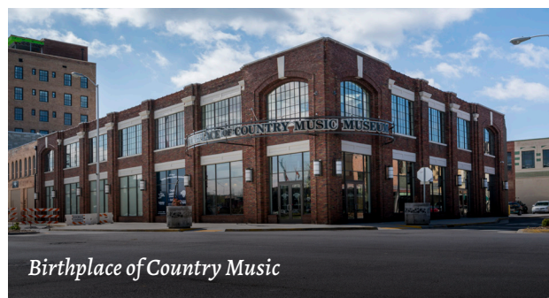
Birthplace of Country Music