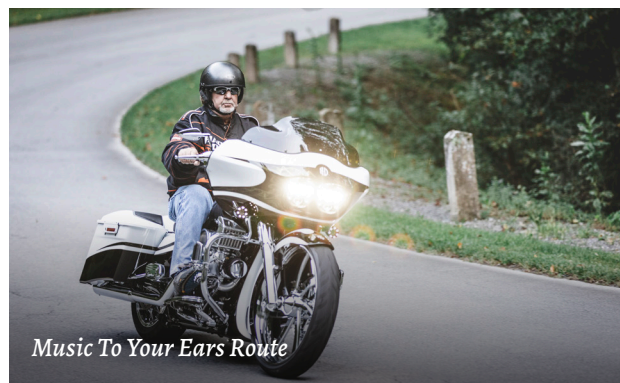
Music To Your Ears Route