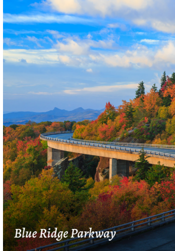
Blue Ridge Parkway

Explore rugged gorges and ride past rocky cliffs, curve around mountain streams and tranquil lakes, and enjoy unique vistas and rural charm on this tour of Northeast Tennessee's stunning landmark lakes.