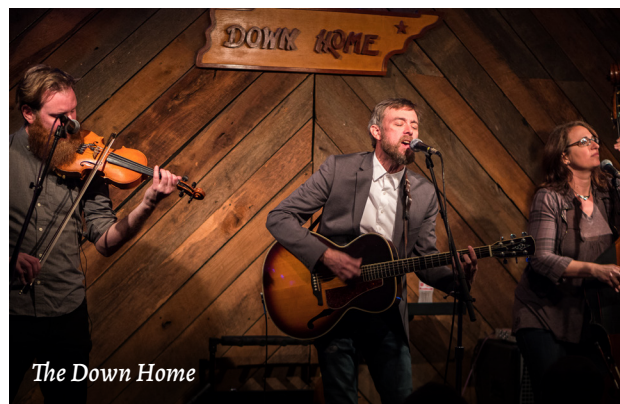
The Down Home