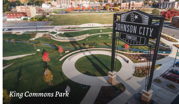
King Commons Park

When you're back in Johnson City, visit the premier listening room, The Down Home. With its "come as you are" atmosphere and intimate listening space, you're sure to have a memorable experience that truly connects you with the music and performers.