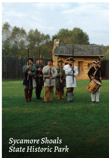
Sycamore Shoals State Historic Park