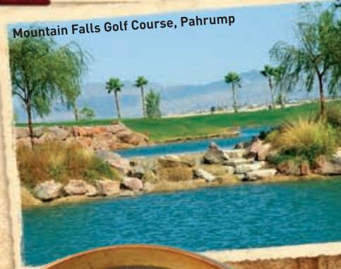
Mountain Falls Golf Course, Pahrump