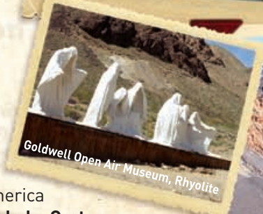
Goldwell Open Air Museum, Rhyolite