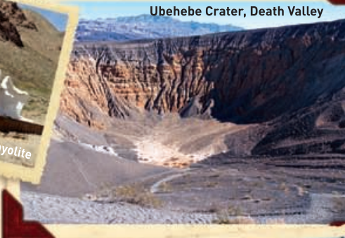
Ubehebe Crater, Death Valley