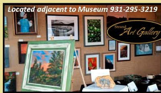
Located adjacent to Museum 931-295-3219