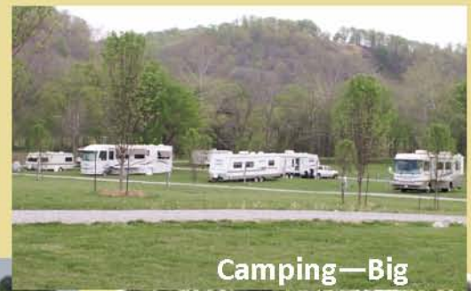
Camping—Big ...or Small