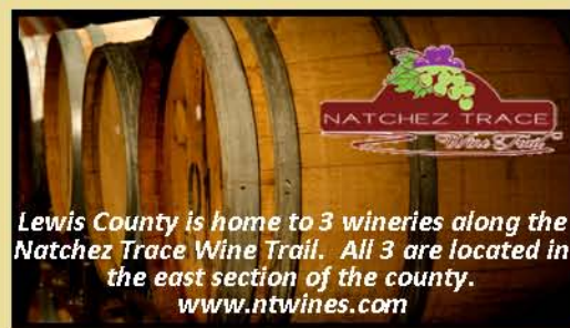
Lewis County is home to 3 wineries along the Natchez Trace Wine Trail. All 3 are located in the east section of the county. www.ntwines.com

Not familiar with Hohenwald's attractions? Check out our video at www.hohenwaldlewischamber.com . Call us at 931-796-4084.