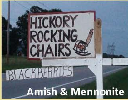
Amish & Mennonite Settlement