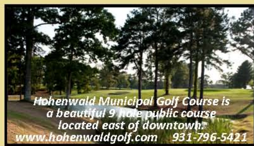
Hohenwald Municipal Golf Course is a beautiful 9 hole public course located east of downtown. www.hohenwaldgolf.com 931-796-5421

Delve into the controversial death of Meriwether Lewis (for whom Lewis County was named) at the Lewis County Museum of Natural History. Was it murder or suicide? Located at 108 E. Main St., downtown Hohenwald. www.lewiscountymuseum.com 931-796-1550