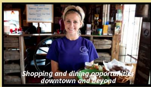
Shopping and dining opportunities downtown and beyond

Welcome Center located at 27 E. Main St., downtown. Hear about "The Girls" and their lives in Sanctuary. www.elephants.com 931-796-6500