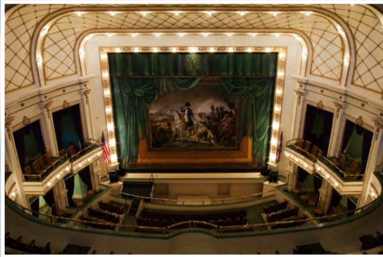
Tour or take in a show at the Brown Grand Theatre , a restored 1907 French Renaissance style opera house. Ask about Earl—the ghost!