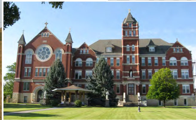
Enjoy a walk on the grounds or ask to tour the Nazareth Convent —home to the Sisters of St. Joseph.