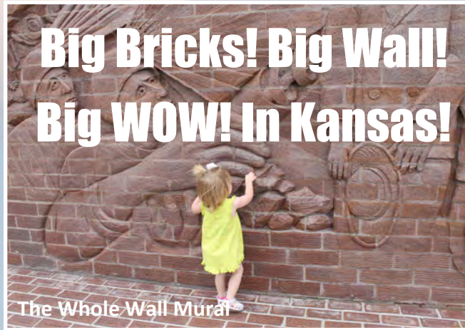
The Whole Wall Mural