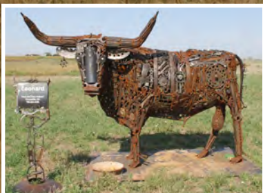
Fun and quirky sights can be found along the way!