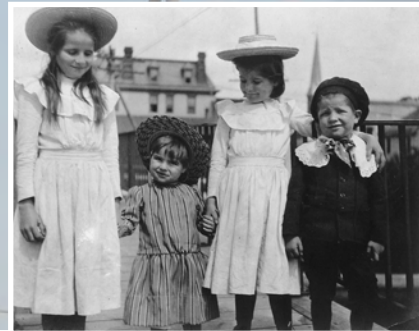
The National Orphan Train Museum tells the story of the estimated 200,000 orphaned and homeless children who were placed out from New York to new homes across America from 1854-1929.