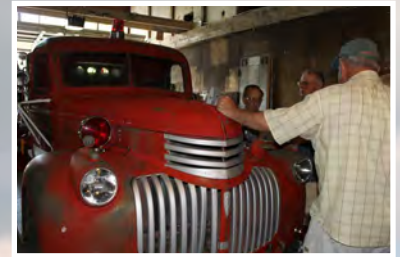
German POW Camp Concordia housed over 4,000 German POWs during WWII.